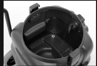
Cyclonic inlet helps knock down foam