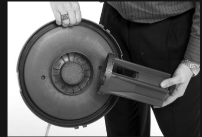
Optional H.E.P.A. protection ring and H.E.P.A. filter