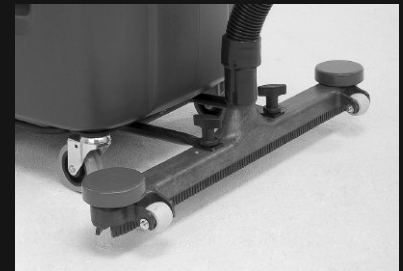
Optional front mount squeegee is available in 24 and 30 inch sizes, for high productivity